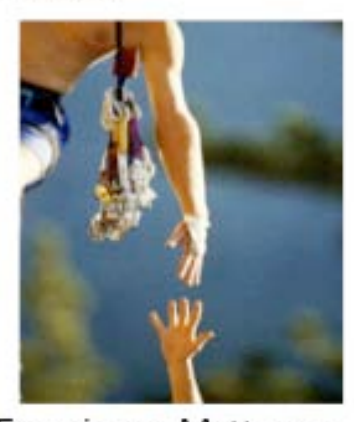
When Experience Matters— Count on Arbor Solutions

700 Commerce Dr. 5th Floor Oak Brook, IL 60523 630.288.4831 wlorimer@arbsol.com